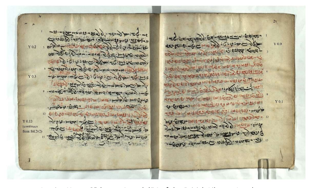
Iranian Yasna Sāde ms. Arundel54 of the British Library, London Avestan with ritual instructions in Pahlavi written in red ink No colophon, but copied before 1646, when the ms. was given to the British Library